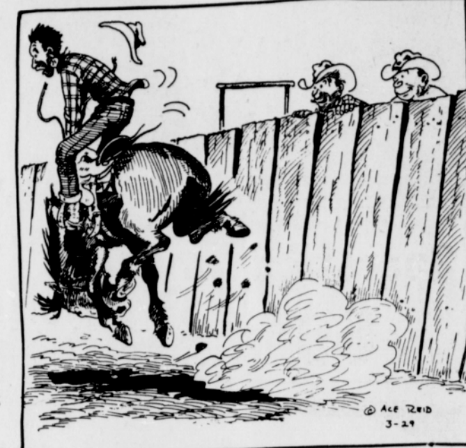
"Boys, if the saddle horn don't pull out, I think he's got em rode!"