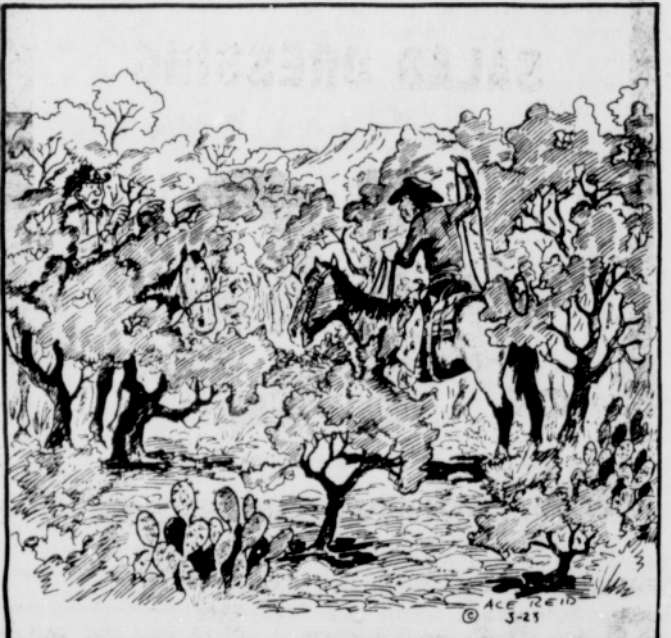
"I'm gonna run that steer by now and fer gosh sakes rope em cause we might not find another clear spot like this fer miles."