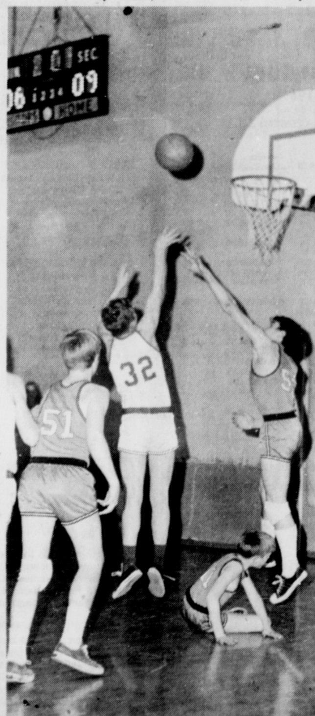
AN ESTACADA seventh grader takes a seat and watches a teammate try to stop the shot of a Sandy Grade School Player. The Sandy team won 46 to 28.