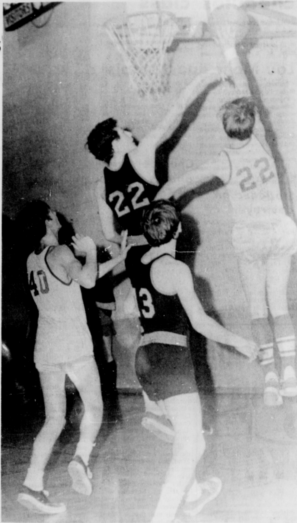
A SANDY player moves for a layup over the outstretched hands of an Estacada defender. Action came during the recent

win by Sandy 8th graders over the visitors from Estacada grade school.