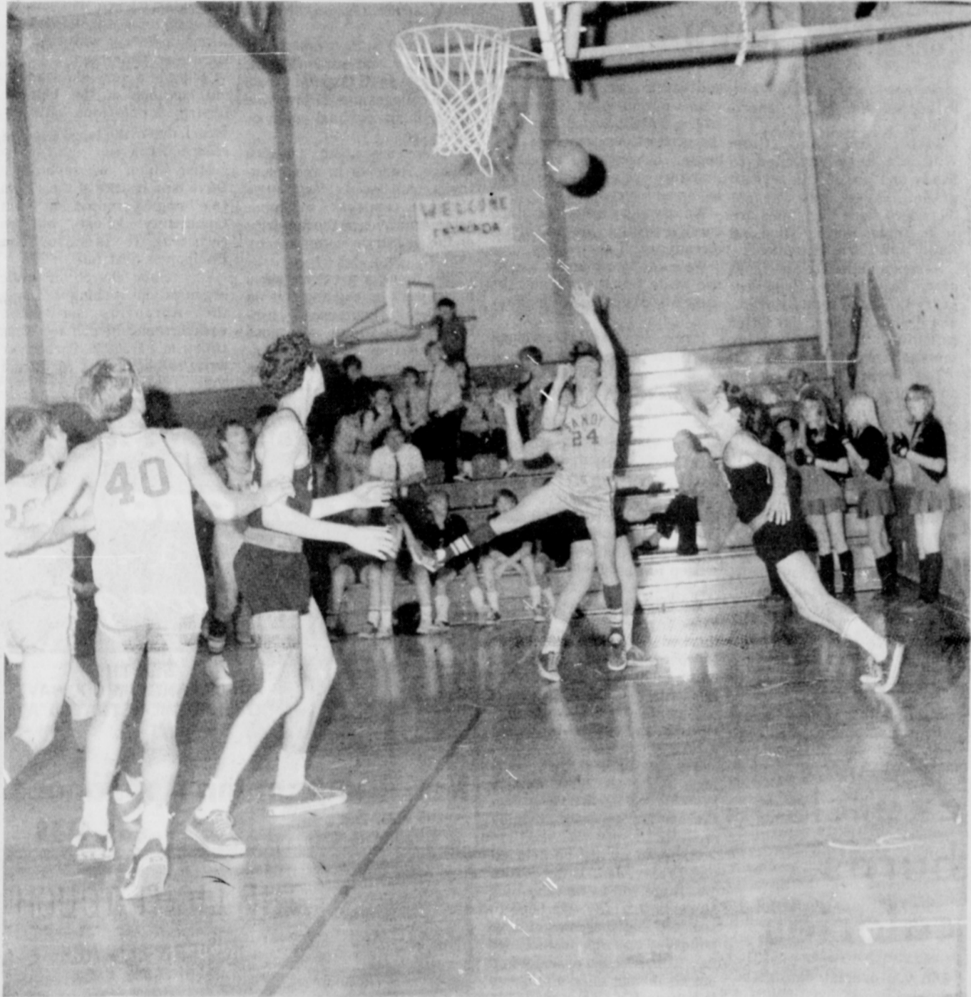
A SANDY player does the splits as he attempts a shot. Players from both Estacada and Sandy prepare to battle for the rebound. The Sandy 8th graders won this game 45

Gresham police reports show that the School Bus Service lot was entered Jan. 10. Seven keys, a first aid kit and 12 fire extinguishers were taken. The loss was set at $170.