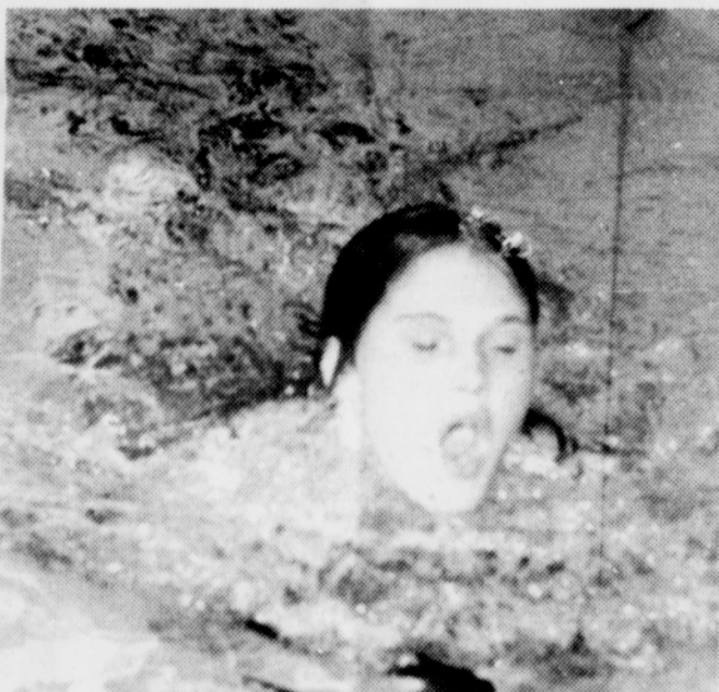
Coming up for air