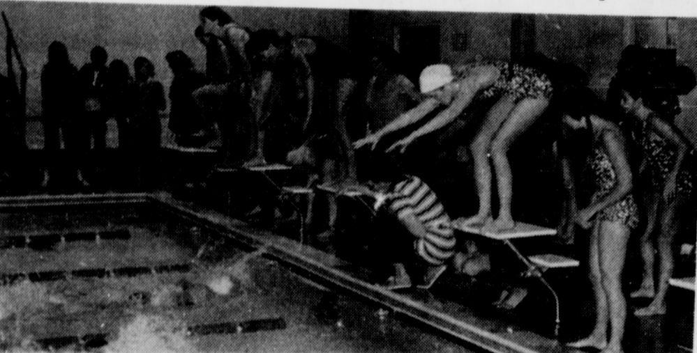
Girls relay teams in action