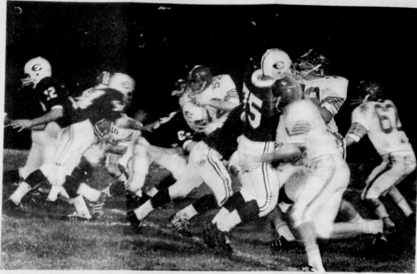
Sandy defensive line charges