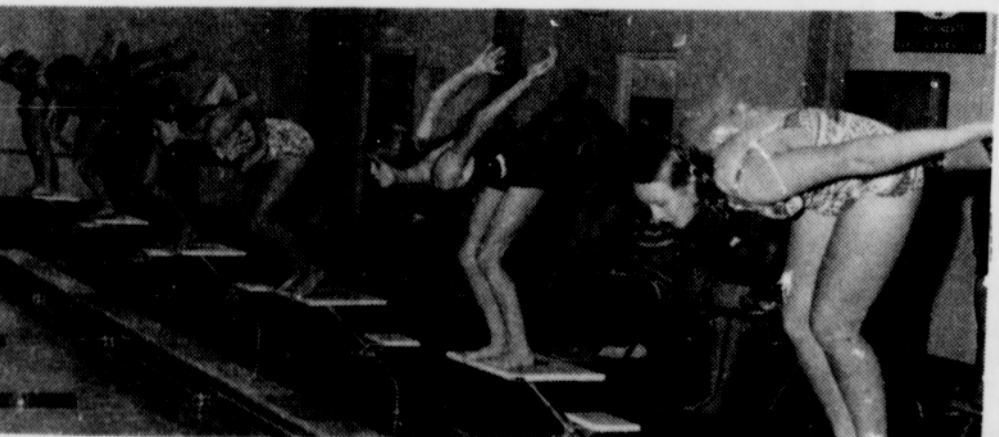
Swimmers ready for race to start