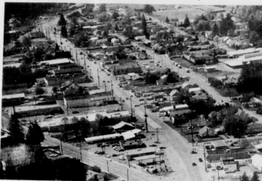
SANDY IS A town divided by its main streets as can be seen from this picture taken from the air last Friday. The recent

warm and clear weather has given the Sandy-Hoodland residents a feeling that summer is on its way.