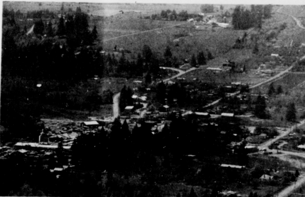
LOOKING AT the Boring area from the sky one sees lumber mills, farmlands and trees. This photo was taken last Friday as

clear skies came to the area, along with warm weather.