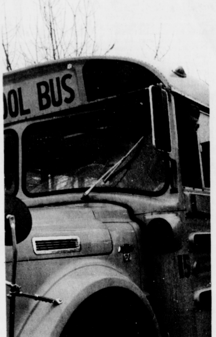
A PERFECT HIT was made on a Sandy Grade School bus window last Friday by a snowball thrown by a youngster. The window damage will cost the district about $80, according to school officials. The incident happened on S. Gunderson Rd. of Duncan Rd. and another bus had to be called to finish making the route. No one was hurt by the broken window but school officials stressed that the kids had been warned not to throw snowballs at the bus during the recent storm.