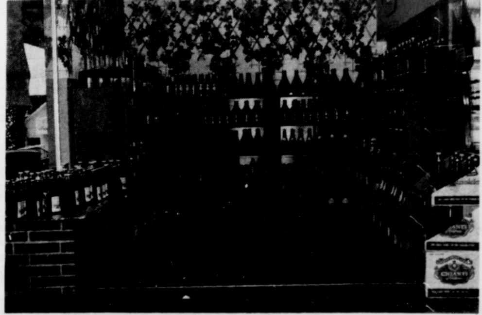
VISIT OUR NEW WINE SECTION WITH ITS WIDE VARIETY OF WINE AND CHAMPAGNES. ANOTHER OF THRIFTWAYS MANY FINE DEPARTMENTS FROM WHICH TO SELECT FROM.