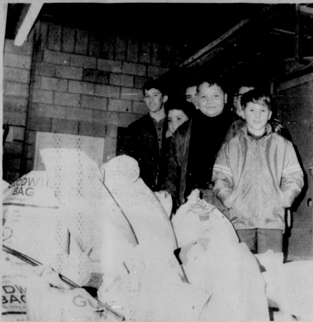
BOY SCOUTS COLLECTED thousands of filled Goodwill bags throughout Tri-County area Saturday. In Sandy, Boy Scouts and Cub Scouts took the filled bags to Sandy fire hall where Goodwill trucks hauled them to Portland. Participation by local residents was reported excellent as a near record collection was made in the Scouts annual Good Turn for Goodwill project.

Nixon obviously must do something to reach the big-city voters. His cabinet appointments and the early moves of his new government almost certainly will reflect this political fact-of-life.