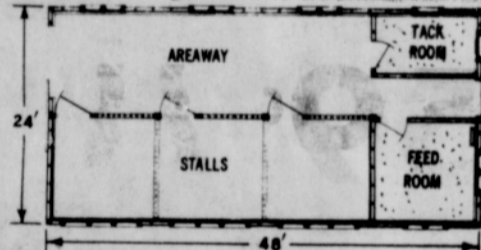
1 1/2 STORY HORSE BARN Plan No. 6024

More than four million horses live in the suburbs and cities of the United States, and the number is still growing. To meet the need for housing the popular pleasure horses, the U.S. Department of Agriculture has designed plans for a 1 1/2 story horse barn, 24 feet wide by 48 feet long. It contains three 12 by 12 foot stalls, a feed room and a tack room at ground level, and a working alley 12 by 36 feet to groom the horses and for other chores.