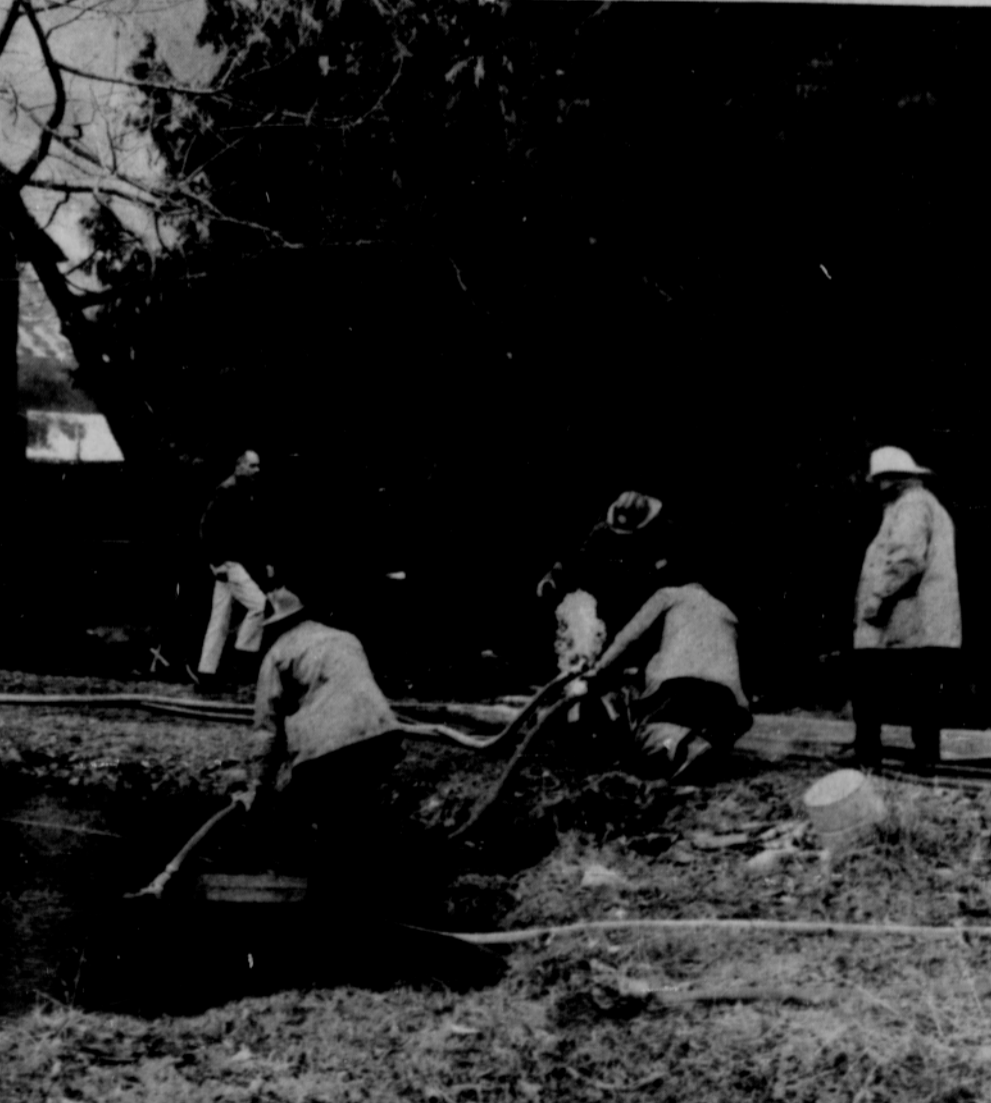
SANDY FIREMEN RIG portable pump in pond near flaming house to add extra hoses on fireline. New pump is tremendous asset in fighting rural fires. When no nearby water source is available the fire district sets pump up in a portable pond which is supplied by tank trucks.