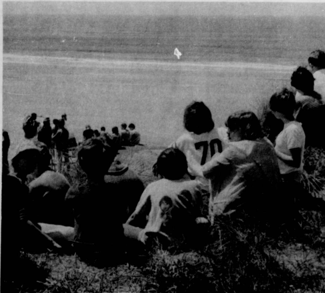
SANDY HIGH SCHOOL STUDENTS took to vantage points at Yaquina Bay State Park, Newport, May 16, to watch for predicted tidal wave that never came. Students were on a field trip to the coast at the time.