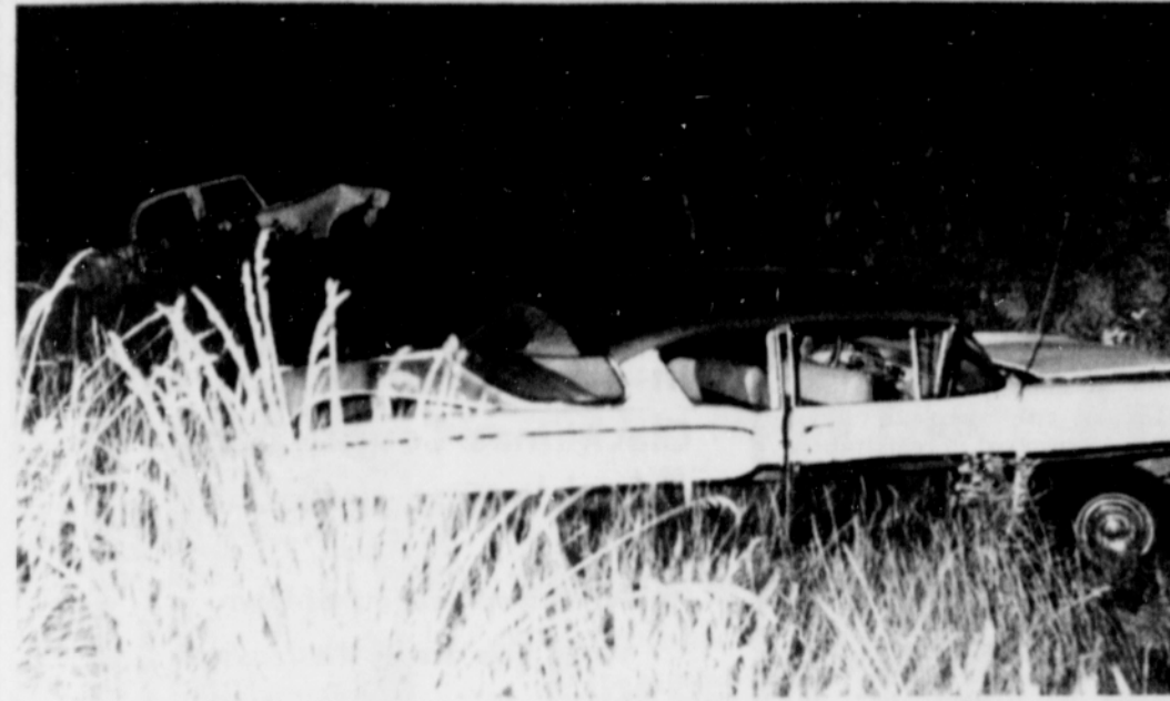
TWO OTHER AUTOMOBILES RESTED in the ditch on the north side of Highway 26 at Shorty's Corner after the wreck at 8:30 p.m. last Saturday. John Watkins, 27, Sandy, was injured in the mishap.