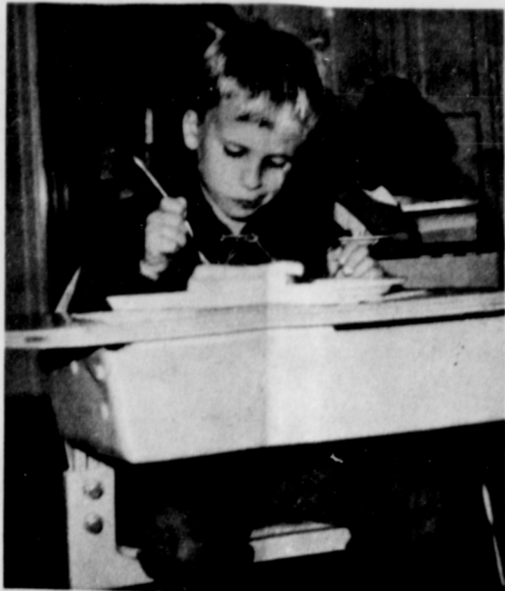
Some youngsters take the business of eating lunch seriously.....