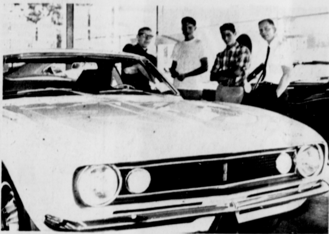
Latest addition to the Chevrolet line, the sporty CAMARO drew more than its share of admiring attention from visitors at Richardson's Chevrolet showrooms last Thursday when new models were on view for first time in Sandy.