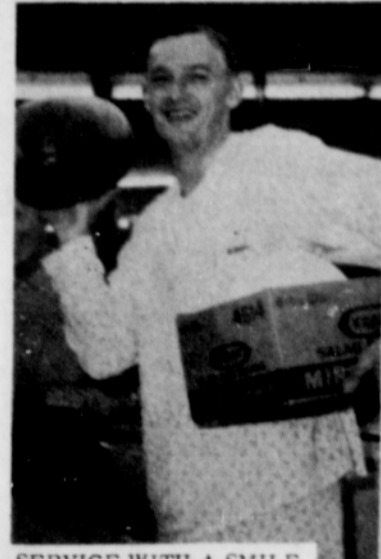
SERVICE WITH A SMILE