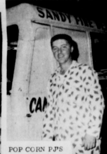
POP CORN P.J'S