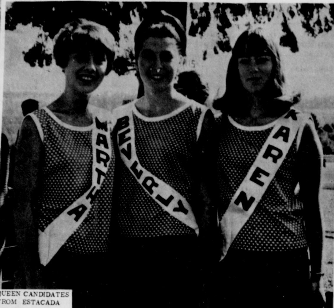
QUEEN CANDIDATES FROM ESTACADA