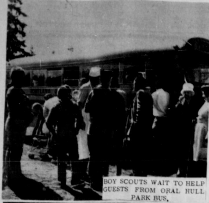
BOY SCOUTS WAIT TO HELP GUESTS FROM ORAL HULL PARK BUS.