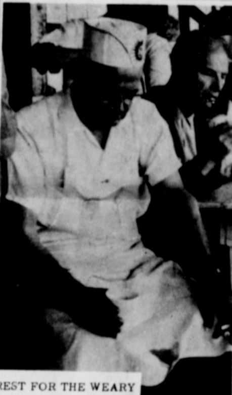
REST FOR THE WEARY

If you haven't stopped by Gay's Kache, you should. Each week seems to bring more interesting merchandise into this fun little shop in Rhododendron.