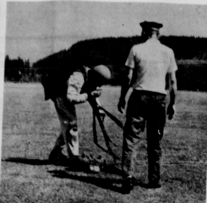
RIGHT ON TARGET