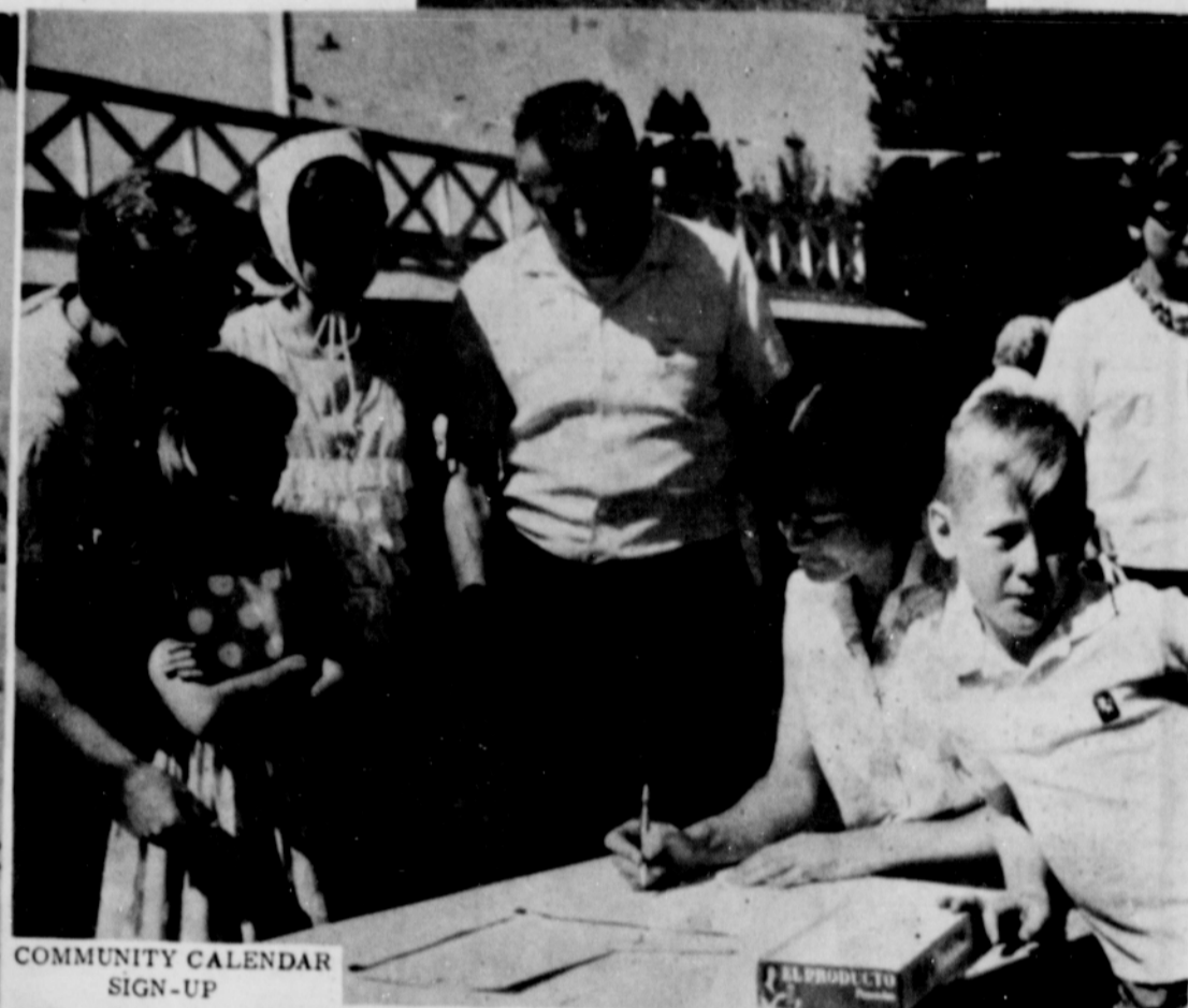
COMMUNITY CALENDAR SIGN-UP