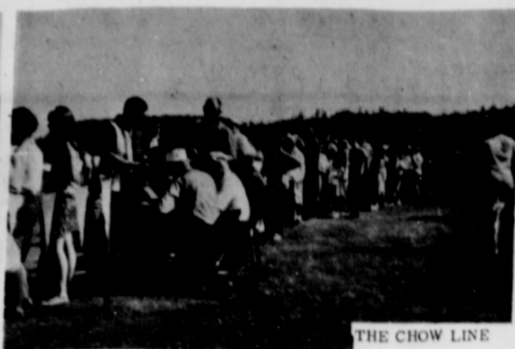
THE CHOW LINE