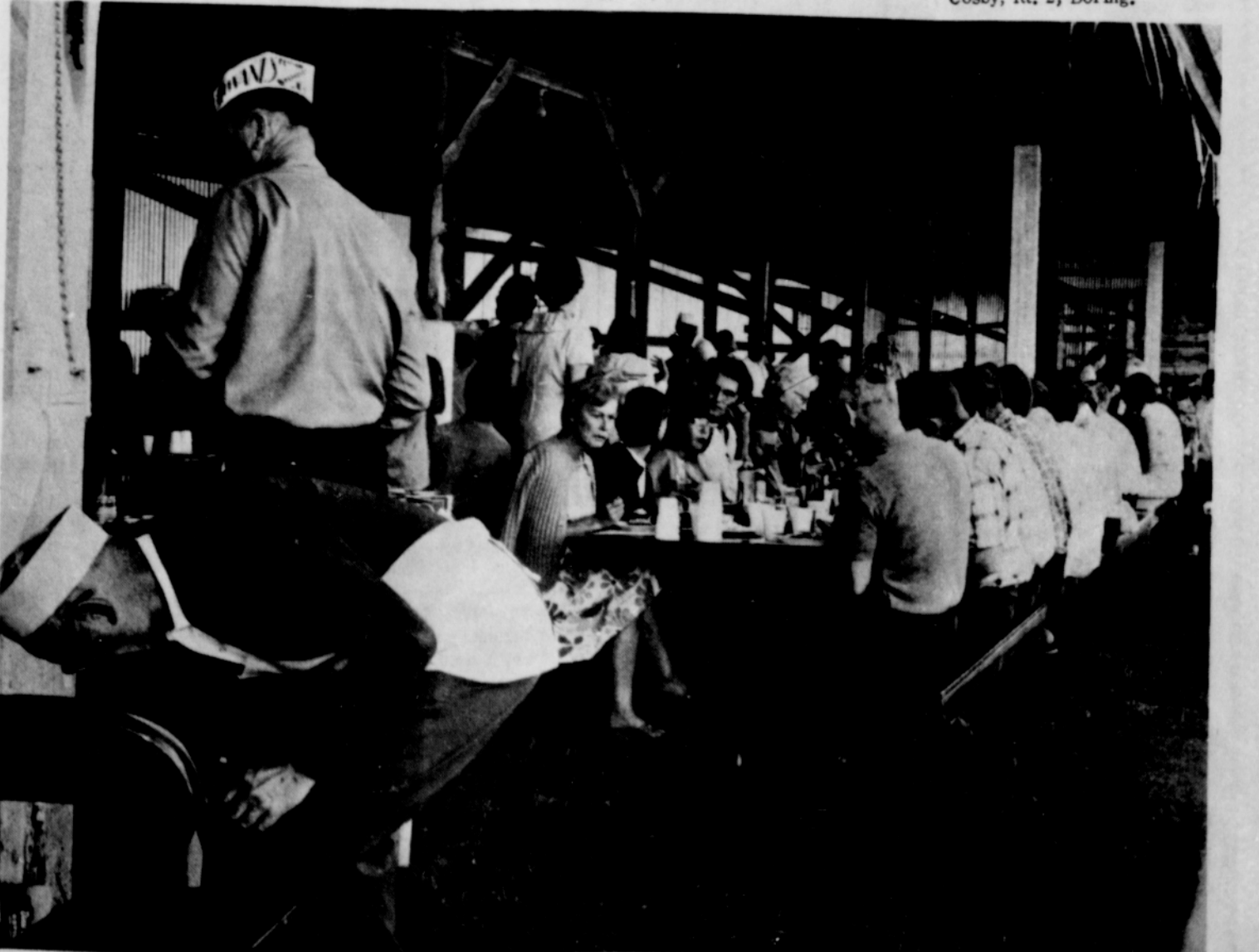
FULL HOUSE at the Fly-In Breakfast. Scene was repeated many times over as constant 5-hour stream of guests enjoyed hearty open-air meal.

Ground breaking for the construction of the new Sandy First Baptist church is expected to start soon. The church group recently purchased property near Kelso and a zoning change which will allow use of the property for church purposes has been approved by the County Planning Commission. First Baptist services are currently being held in the Sandy Women's Club with Sunday school at 9:45 a.m., church at 11 a.m., training union at 6:30 p.m. and evening service at 7:30 p.m.