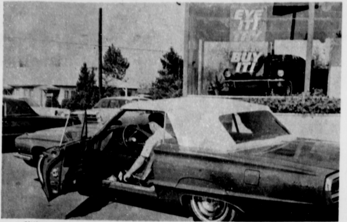
Sitting in the driver's seat of a new 1966 Ford Thunderbird convertible during the recent Glos Ford new car showing is one of the many persons who attended. The Sandy Ford car dealer reported a good turnout for his showing.