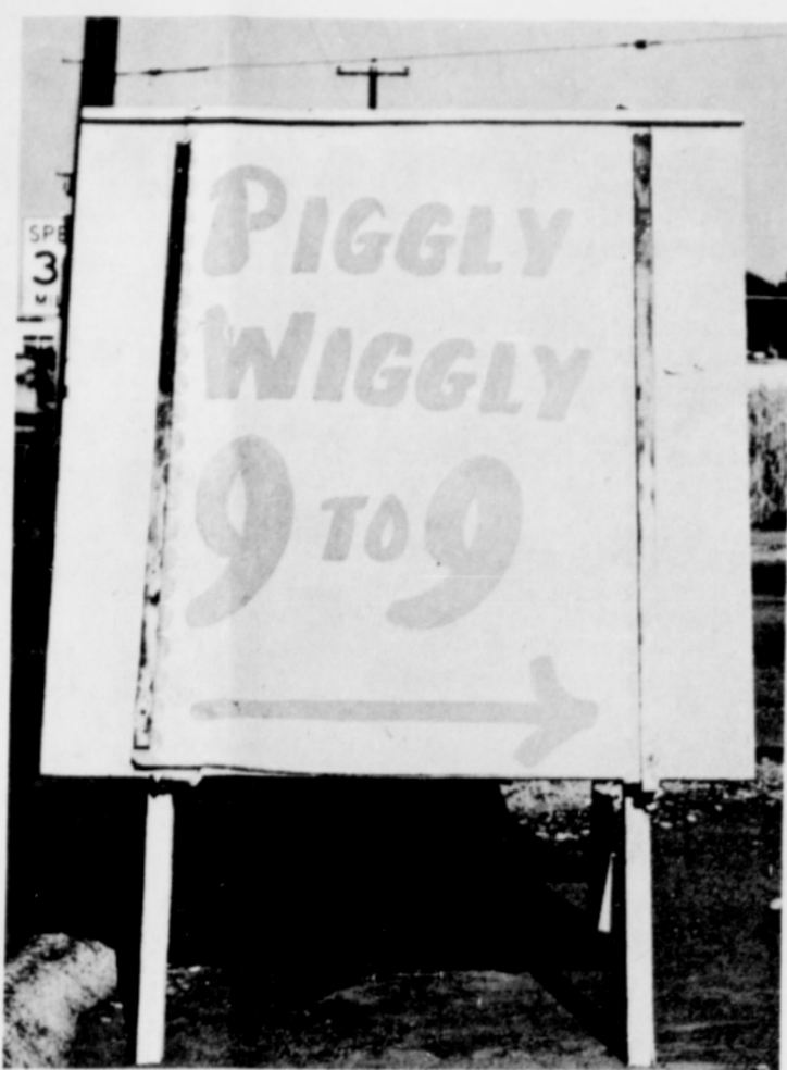
Stores put up signs to advertise their own business and not another's... at least that's what we thought until we saw these signs last week. One in front of the local bowling establishment points out the way to the grocery store on the

SEE YOUR LOCAL FORD DEALER! HE'S A GOOD MAN TO KNOW! GLOS FORD MT. HOOD HWY. & TENEYCK RD. SANDY, OREGON