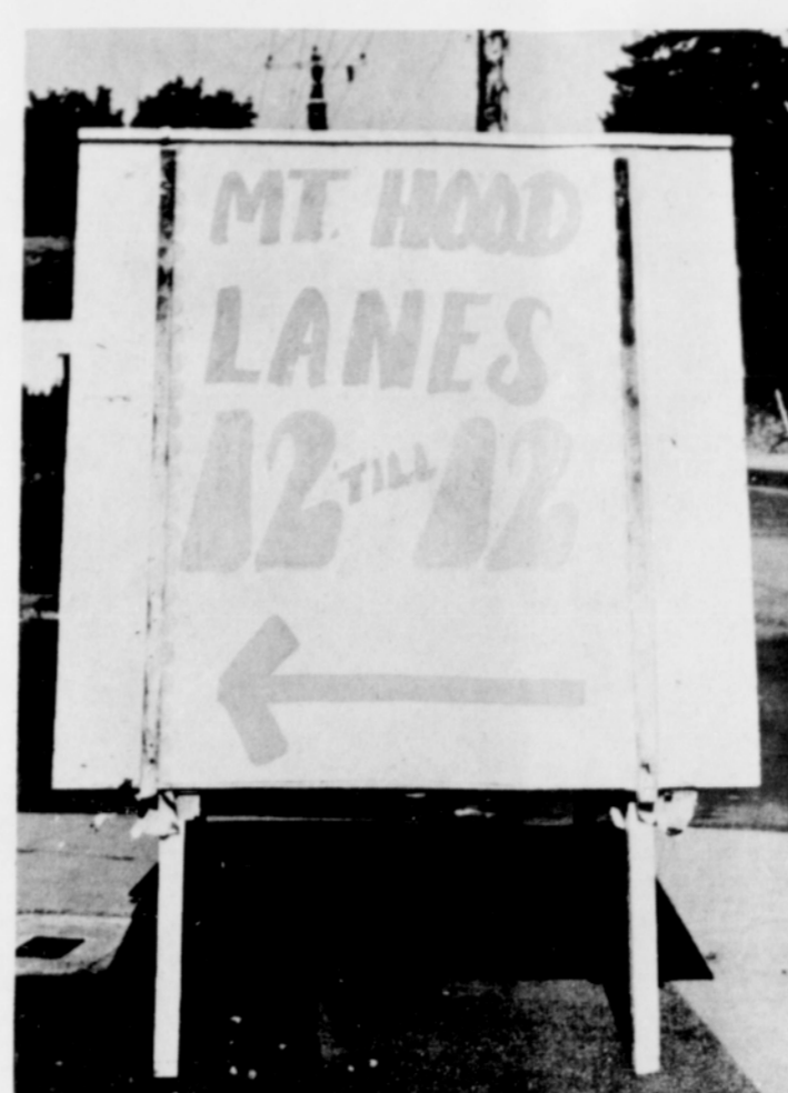
next corner and the grocery store in turn has erected a sign directing the way to the kegging arena. Such friendly cooperation earns our praise and this bit of free advertising.