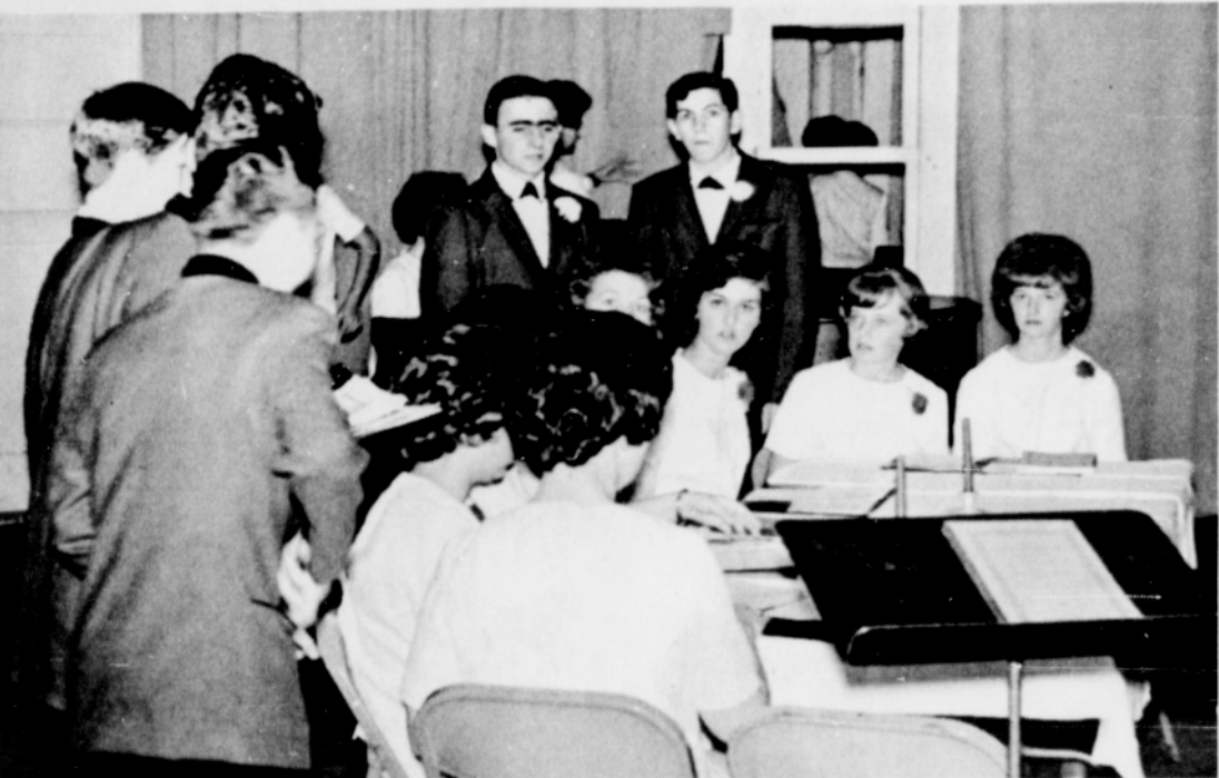
Feeling that they were restricted in scope by singing only madrigals, the former 'Madrigal Singers' above have changed their name to 'Flon-aires' and have added a variety of new tunes to their repertoire. They are shown at last Wednesday's concert taking their places on stage behind the curtain.