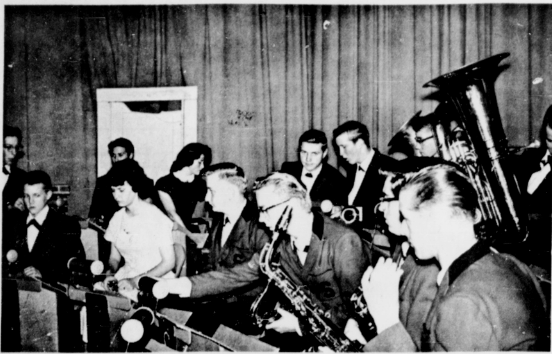
The high school Show Band warms up prior to start of last week's concert. Colorful in their hunting-red blazers, they're almost as much of a treat to look at as they are to listen to.