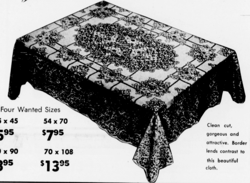
Four Wanted Sizes

45 x 45 54 x 70 $5 95 $7 95 70 x 90 70 x 108 $8 95 $13 95