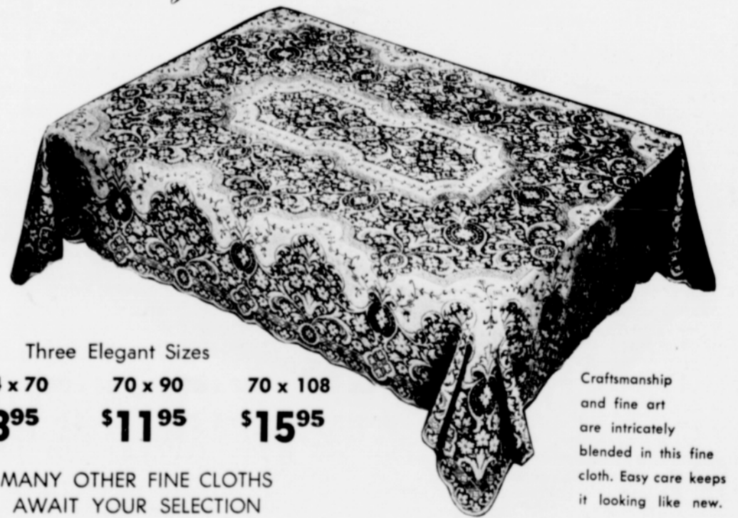
Three Elegant Sizes

54 x 70 70 x 90 70 x 108 $8 95 $11 95 $15 95