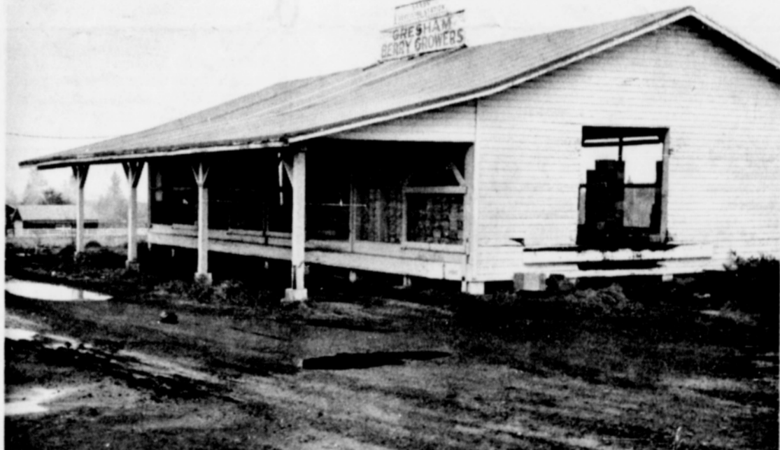
Just west of Sandy on Loop highway, this is the future home of Janz Berryland. With plenty of room for off-the-road parking, the