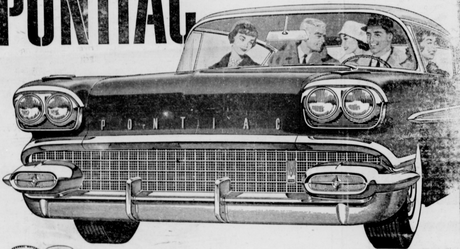
The Golden Jubilee Car

Bold New Engineering Floats You on Air with the Most Perfect Suspension System Yet!