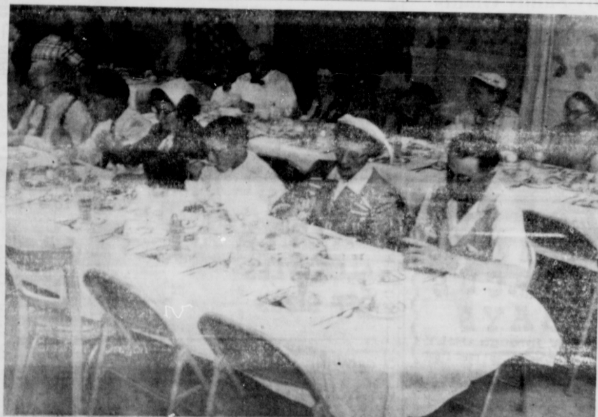
HOOD RIVER —Here are some of the guests from Sandy who traveled the Lolo Pass last Sunday in the biggest caravan to go over the route on the West side of Mt. Hood. At