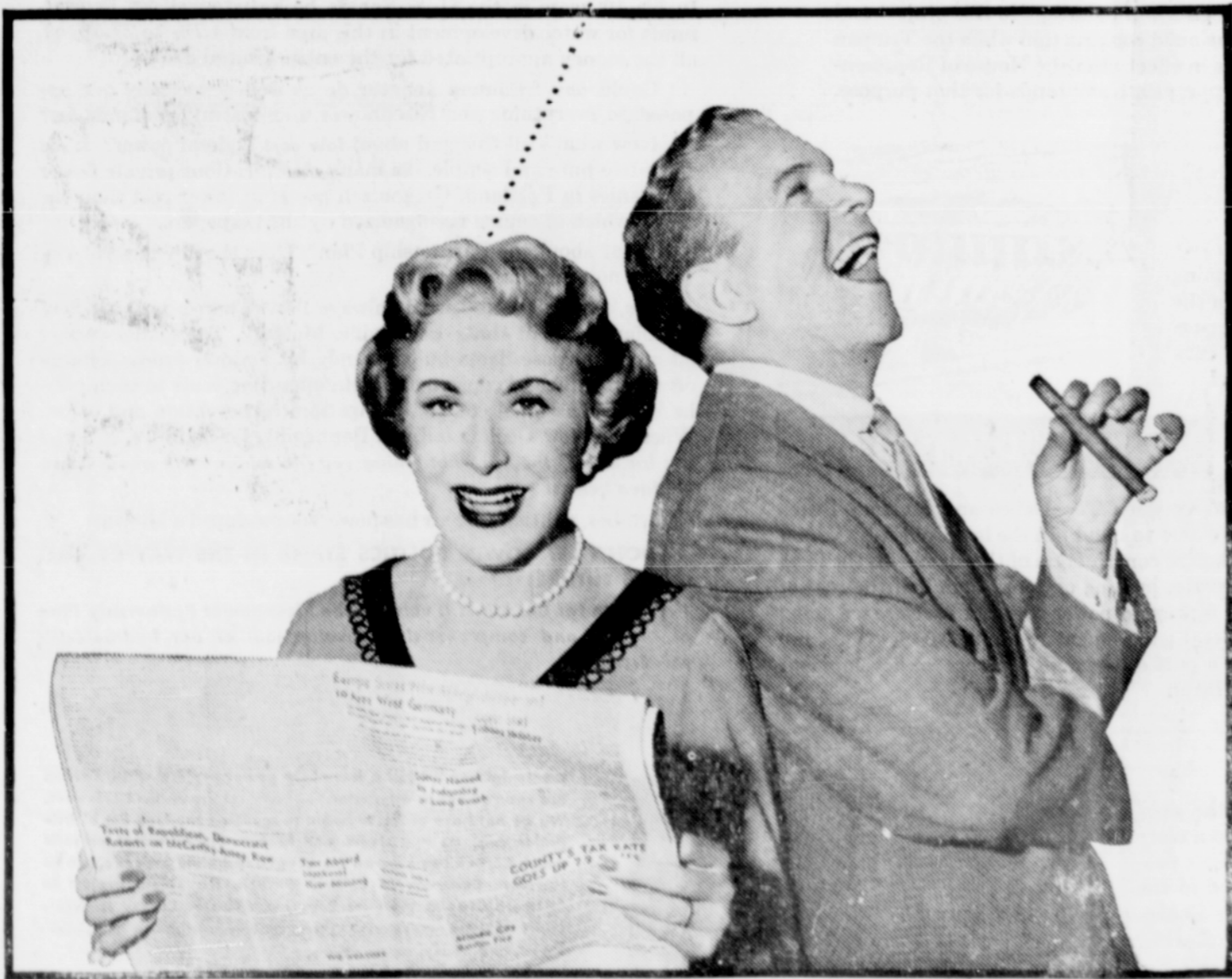
See the Burns and Allen Show Monday 8:00 P.M. on the CBS TV Network

Well, they could be coming out with a seven-cylinder car!