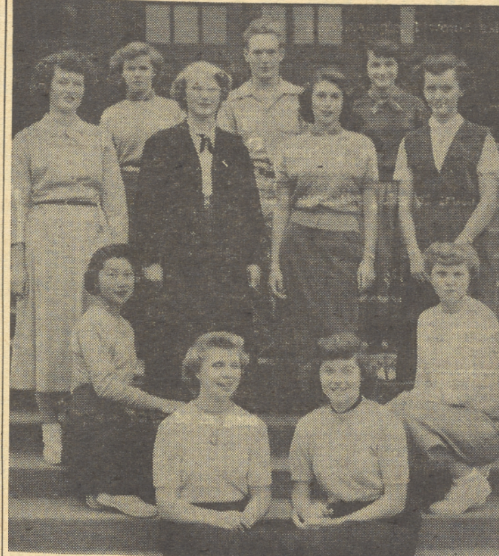
Recently elected Sandy high school class yell leaders will lead their classes in yells for inter-class competition.