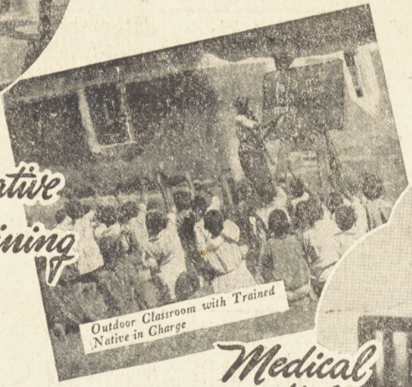
Outdoor Classroom with Trained Native in Charge