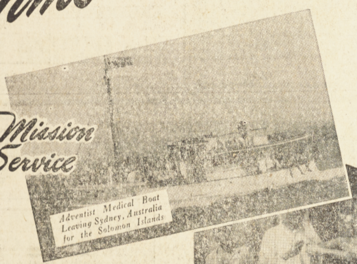
Adventist Medical Boat Leaving Sydney, Australia for the Solomon Islands