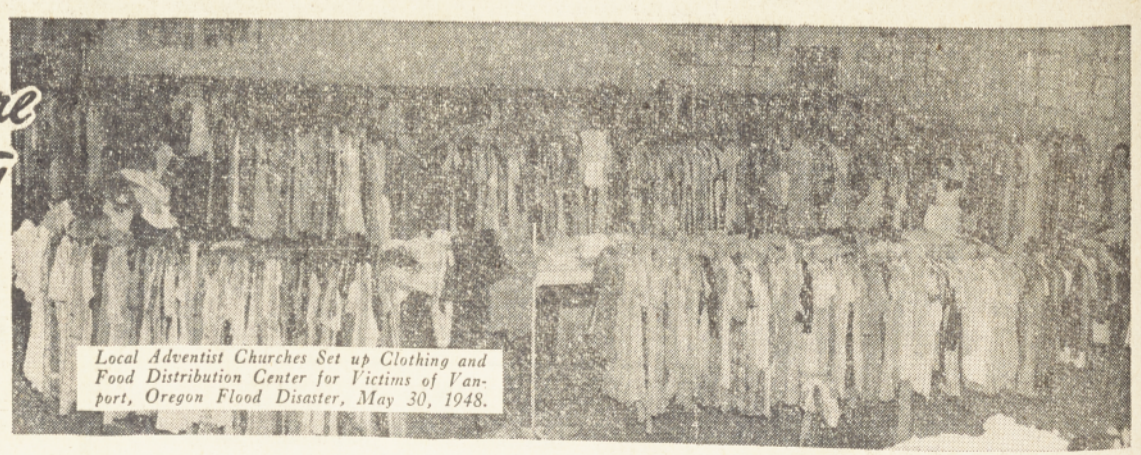
Local Adventist Churches Set up Clothing and Food Distribution Center for Victims of Vanport, Oregon Flood Disaster, May 30, 1948.