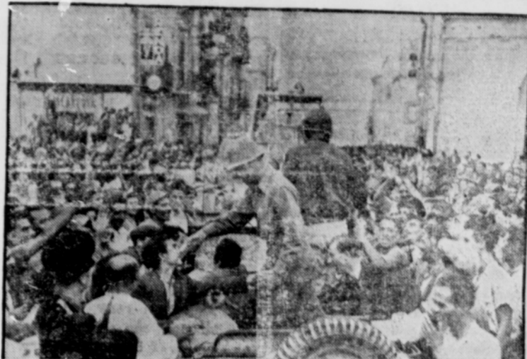
PALERMO, SICILY —Their faces bright with joy, friendly Sicilians mob an army vehicle, anxious to shake hands with some of the Yanks who freed their homeland from the clutches of the Fascist foe. Cheering, grateful crowds like this greeted our doughboys as they rolled through captured towns throughout Sicily.