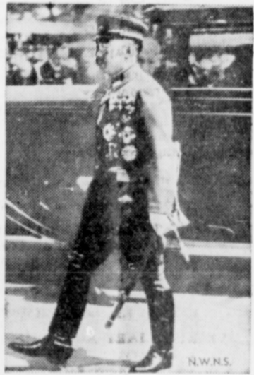
Here is a recent and particularly excellent photograph of Emperor Hirohito of Japan. It was taken at a national monument after he paid his respects to the war dead who have recently been enshrined there.

Camp Moffit which is located on Larch Mountain for the 100 workmen employed in clearing for the new 115,000-volt line for a direct connection between Bonneville and Oregon City, is progressing in good shape. This line is for the purpose of supplying power to the Portland area for defense industries.