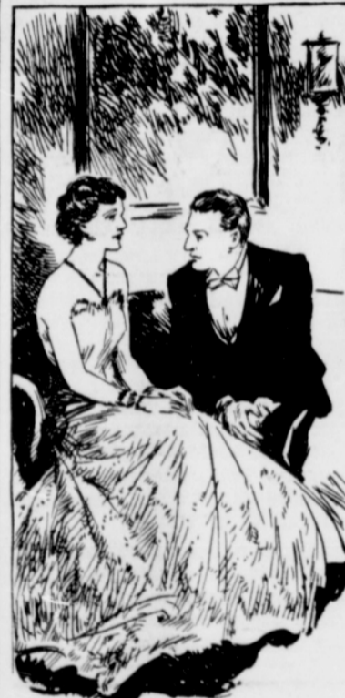
"We could go away, now, tonight, down into Maryland."

"Do you mind? I won't go if you do. I know I haven't been home with you much and it was nice of