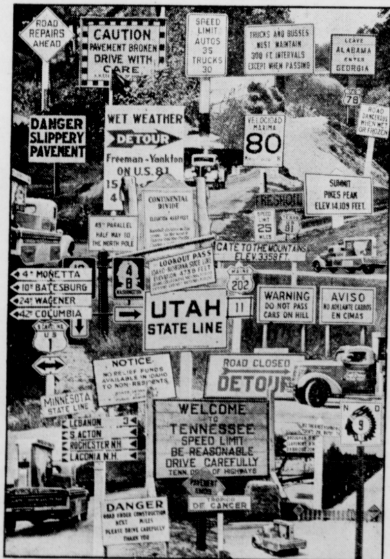
Signs of the times in a motor age—these highway markers tell the story of a two-year, 100,000-mile truck test run recently completed by Chevrolet. In Canada, Mexico and every state of the Union, the truck operated on all types of highways and under every conceivable weather hazard, setting a new world mark for sustained and certified automotive operation, under the sanction and official observation of the American Automobile Association. The unit carried a 4,590-pound "payload." An average of 15.1 miles per gallon of fuel was maintained throughout the 100,000 miles, at an average operating speed of 33.07 miles per hour. Oil mileage was correspondingly high—1,072 miles per quart.