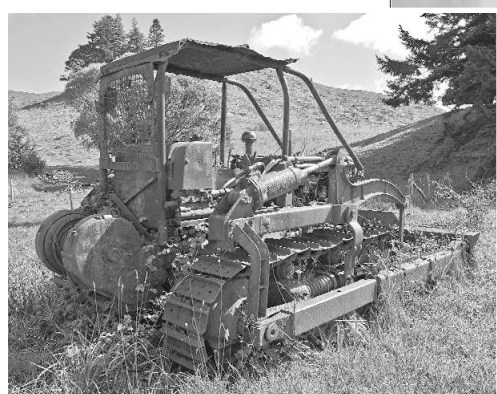
This old catapillar is out on Flores Creek Road, just slowly rusting away ...