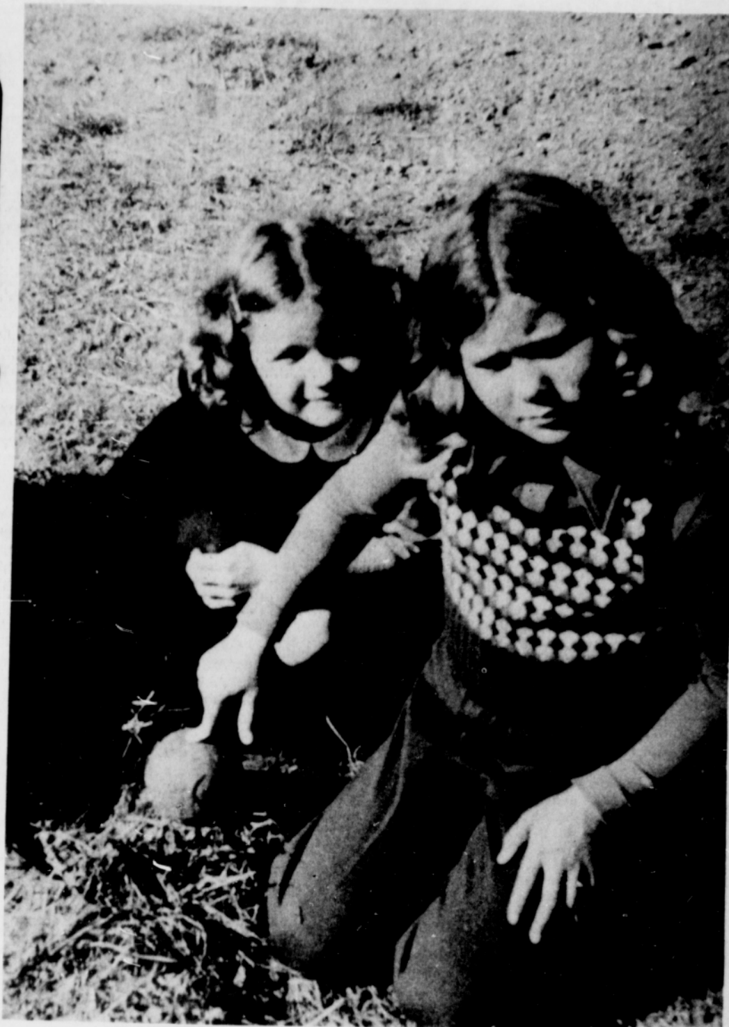
Memory Of Indian War