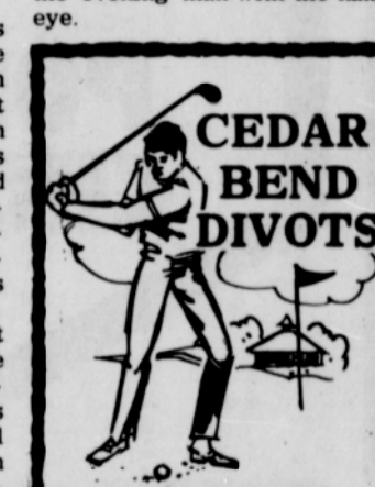
by Duane Bergstrom

WASHINGTON—More than eight million gallons of paint and thinner are used each year in the manufacture of one million average frame homes.