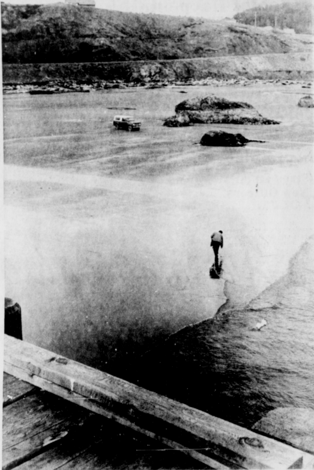
ANOTHER demonstration of low water beach adjacent to dock. Here Jack Smith shows new potential clamming area caused by heavy shoaling. Low water previously came up to rock near Smith's vehicle.