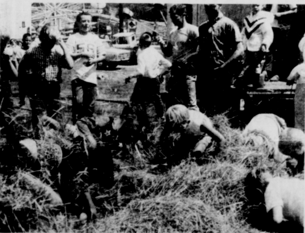
A popular event at the recent Curry county fair was the kids' money scramble.

Pacific High School boys are reminded that football practice will begin Monday, August 25, 1 p.m. at the high school. Boys must have physicals before equipment is issued. Insurance is also required.