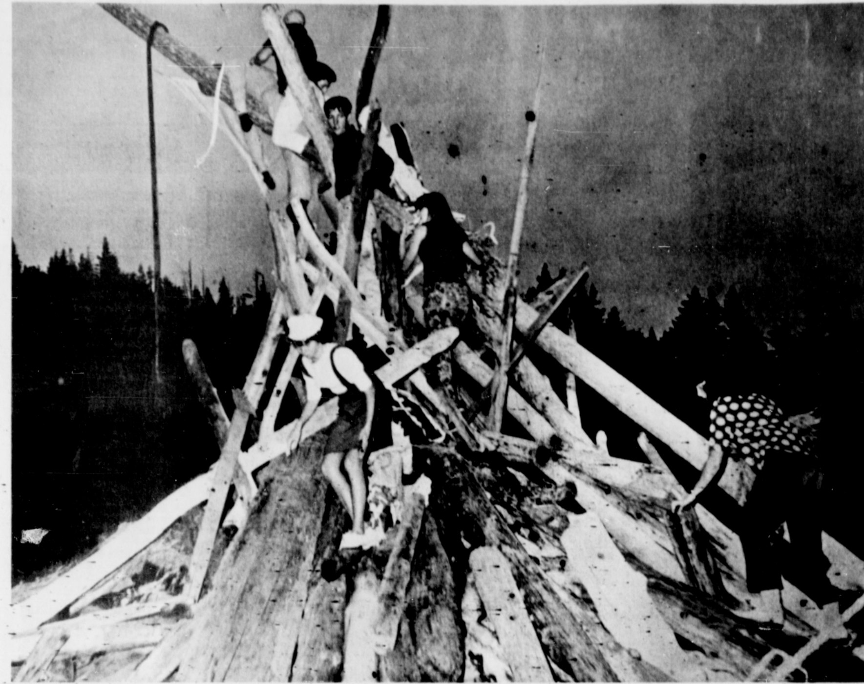
UNDERCLASSMEN prepared this huge pile of driftwood on Battle Rock beach for the Homecoming bonfire. Students at top are hanging a Coquille Red Devil in effigy.