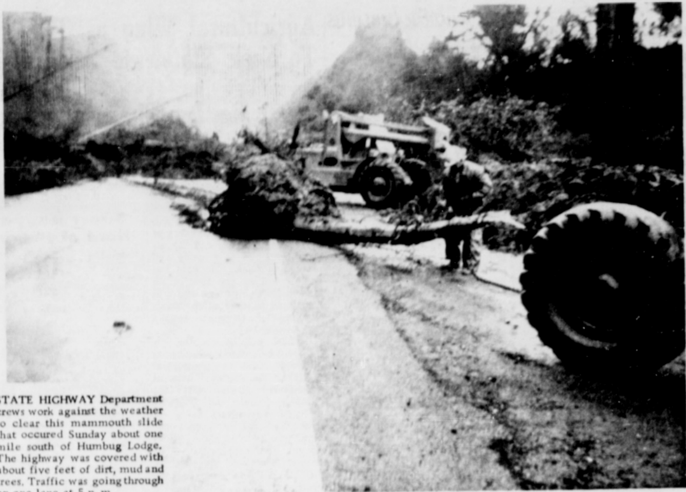
STATE HIGHWAY Department crews work against the weather to clear this mammoth slide that occurred Sunday about one mile south of Humbug Lodge. The highway was covered with about five feet of dirt, mud and trees. Traffic was going through on one lane at 5 p. m.