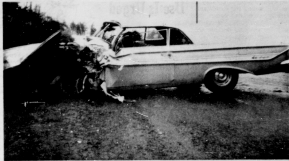
Carpenter vehicle totaled, one injured