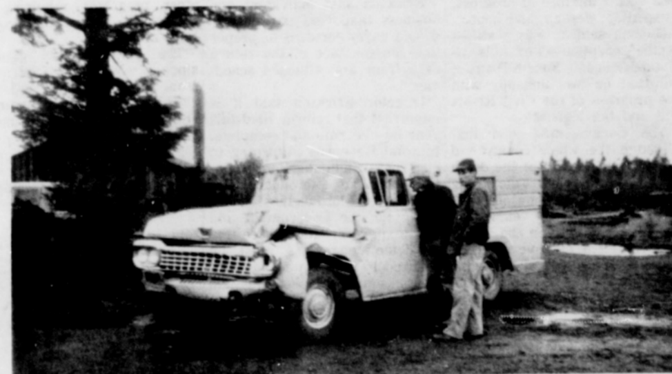
Reuter-crona pickup, damage mild, no injuries

Three persons received injuries Monday in an accident involving a car and two pickups about two miles north of the city limits, just past the Pacific Builders. The accident occurred at 10:25 a. m.