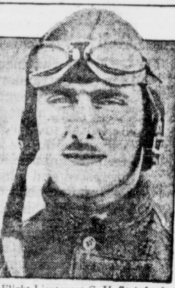
Flight Lieutenant G. H. Stainforth flew at the rate of over 404 miles an hour down wind in British speed tests at Calshot.

FOR SALE—Standard make Piano near Port Orford. Will sacrifice for unpaid balance. A snap. Easy terms. Write, Tallman Piano Store, Salem, Ore. Sit3c.