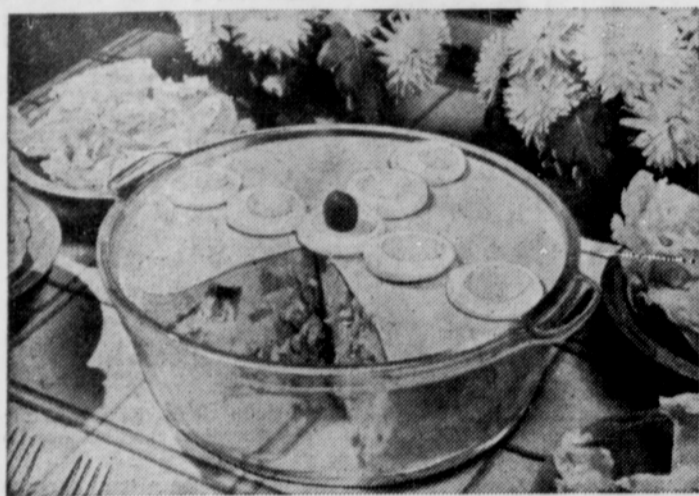
PUDDING FAVORITE AS MEAL TOPPER-OFFER (See Recipes Below)