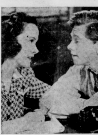
Kathryn Grayson Mickey Rooney in "Andy Hardy's Private Secretary."

Whether you're an "Andy Hardy" fan or not you mustn't miss "Andy Hardy's Private Secretary," if you want to see the debut of one of film-tom's best bets. She's Kathryn Grayson.