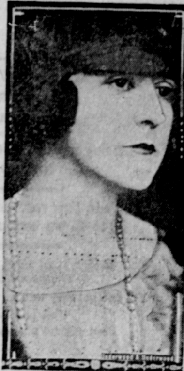
Mrs. Edith Vanderbilt, widow of George W. Vanderbilt, was married in London to United States Senator Peter Goelet Gerry of Rhode Island. Mr. Gerry was divorced by his wife in Paris recently.