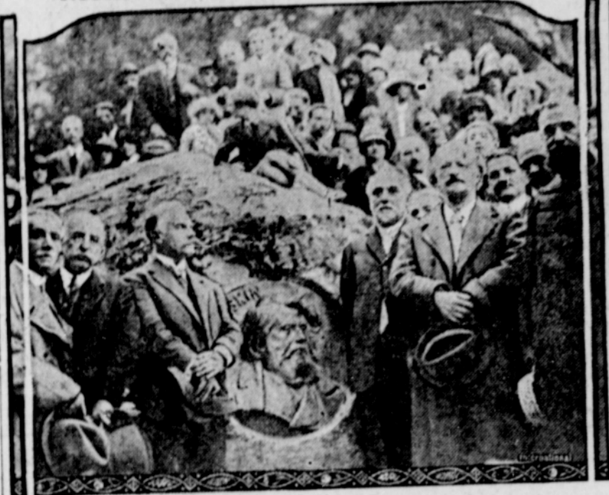
Scene at the unveiling of a memorial to Ruskin at Chamoni, France. In the foreground near the right is seen Ignace Paderewski, the famous Polish pianist and statesman.