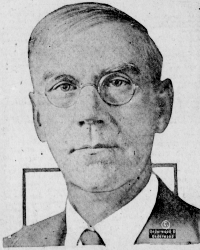
Senator Reed Smoot of Utah has shaved off his mustache, so this recent portrait of him is of especial interest. Besides being one of the most prominent Republican members of the senate, Mr. Smoot is a member of the American debt-funding commission.