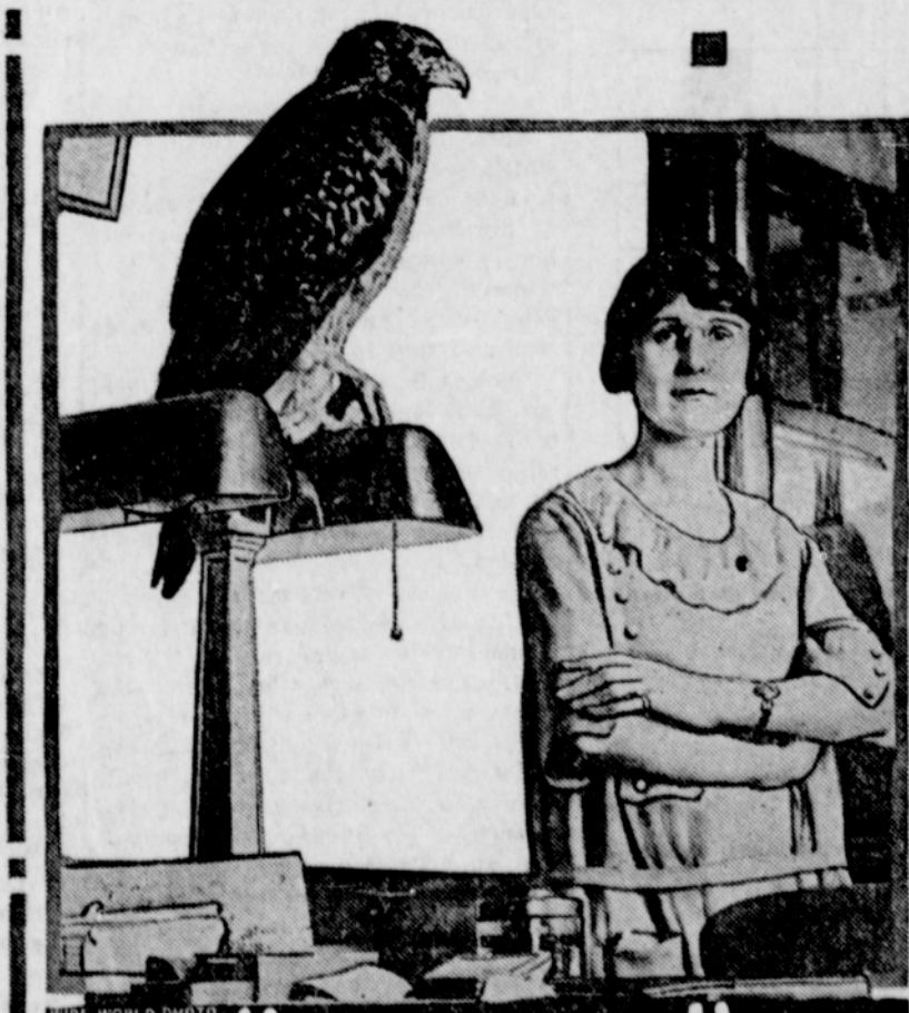
This hawk made an early morning call at a St. Paul (Minn.) office, remained only long enough to have his picture snapped over the stenographer's desk and then departed through the open window.