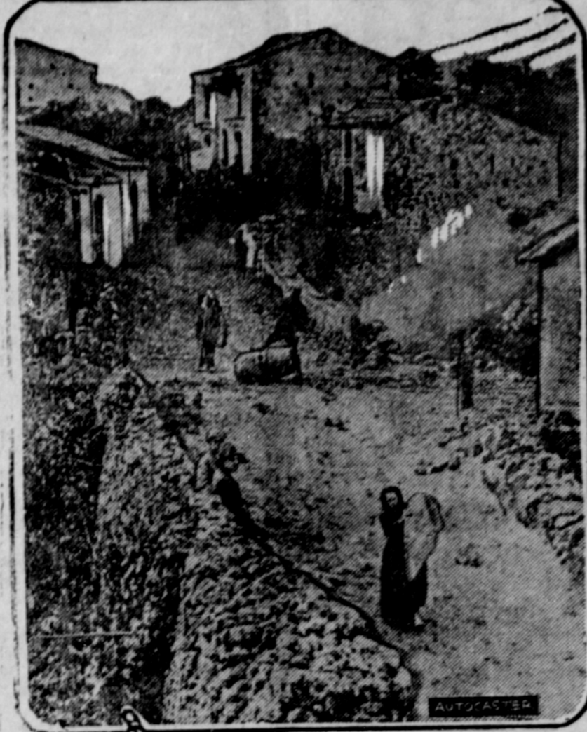
A sad sight in a little town at the base of Mt. Etna in Sicily, showing a village which was later completely destroyed by a torrent of lava from the volcano. As this exclusive photo was taken, the ashes were falling, women and children were fleeing and military police were making avert to remove inflammable materials.

Perle Hogle is now home with his family for a few weeks from his work in Portland.