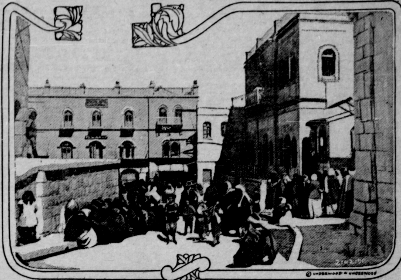
Mohammedan women and Christians, all hungry, ragged; children and beggars, gathered at the relief headquarters opposite David's tower in Jerusalem, to receive food and clothing.