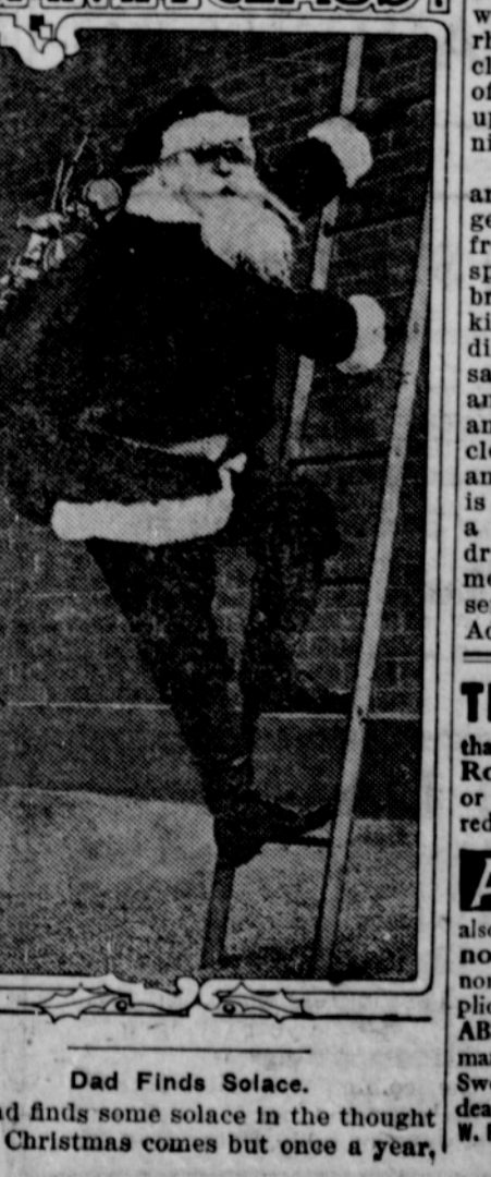
Dad Finds Solace. Dad finds some solace in the thought that Christmas comes but once a year.