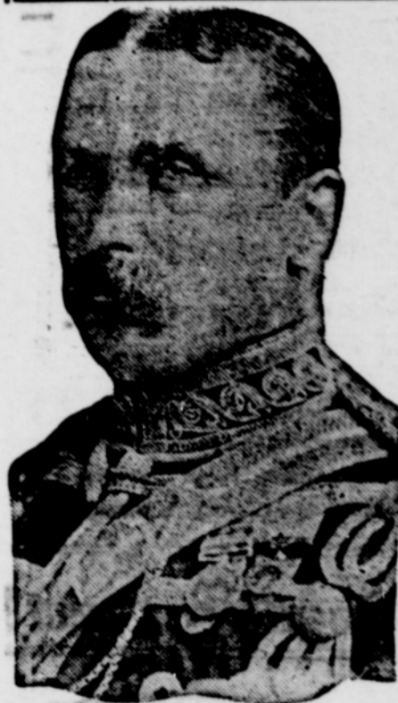
General French, commander-in-chief of the British troops now aiding the French and Belgians.