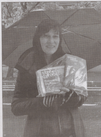
Street Roots Vendor Char