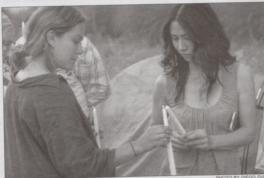
Demonstrators at Occupy ICE event in June.