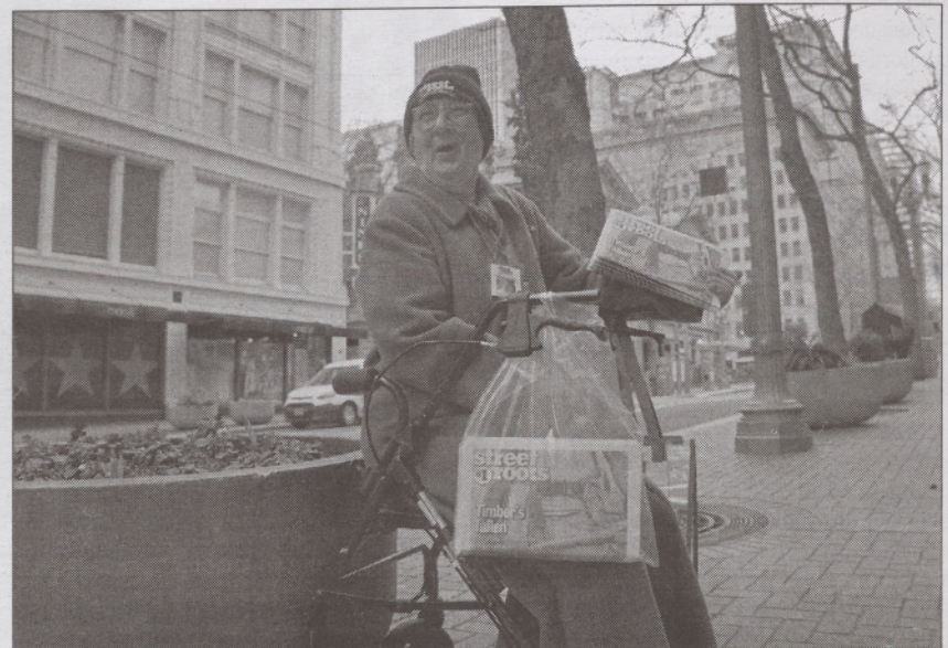
STREET ROOTS PHOTO

Street Roots recently asked our vendors about their first-hand experiences with law enforcement, specifically if they have ever felt profiled or harassed by the police. Here are some of their responses.