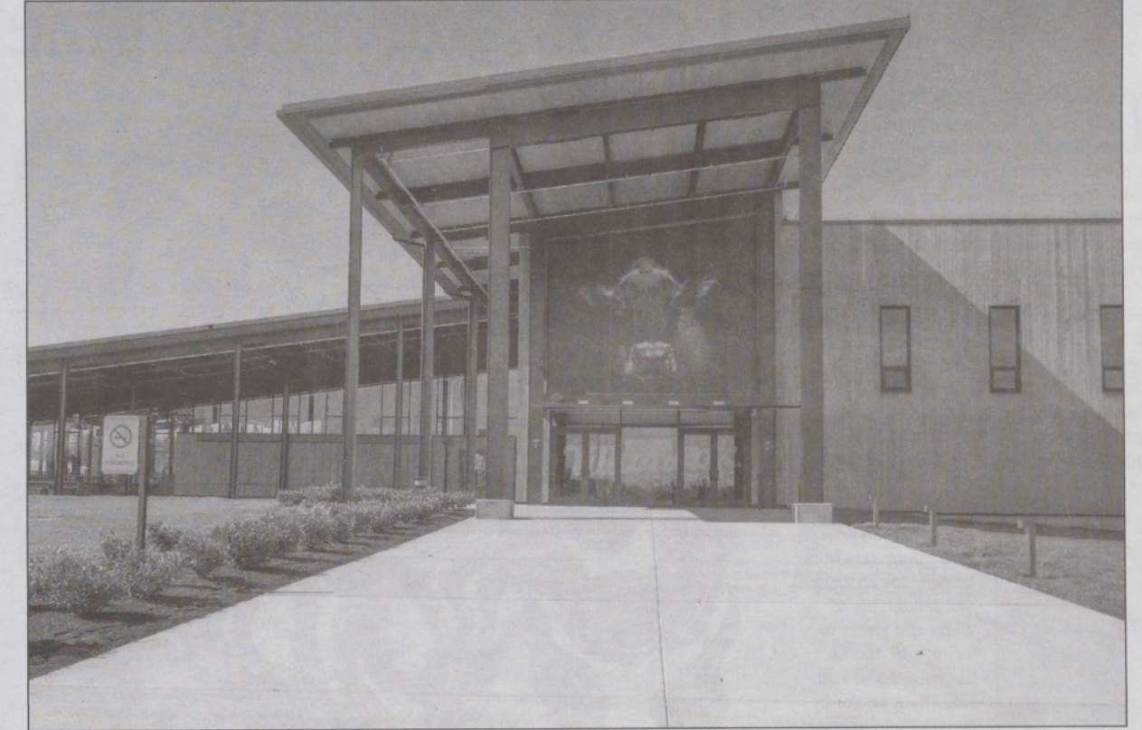
The newly constructed Tillamook Creamery and visitors center.